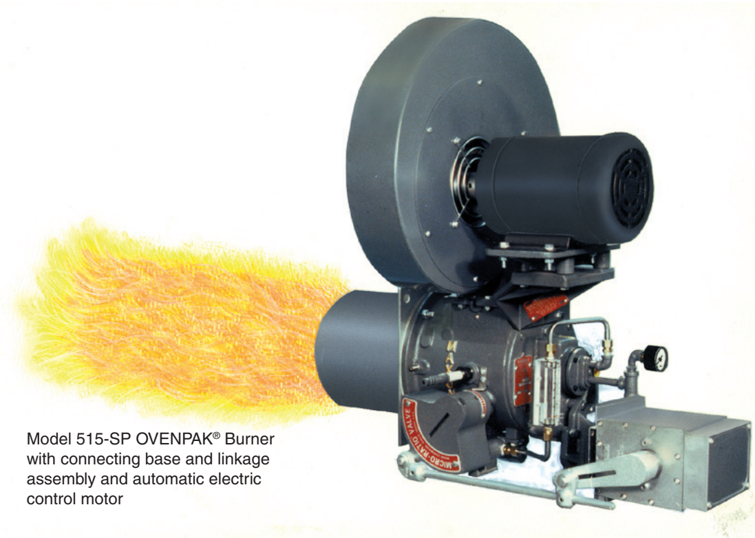
Model 515-SP OVENPAK® Burner with connecting base and linkage assembly and automatic electric control motor